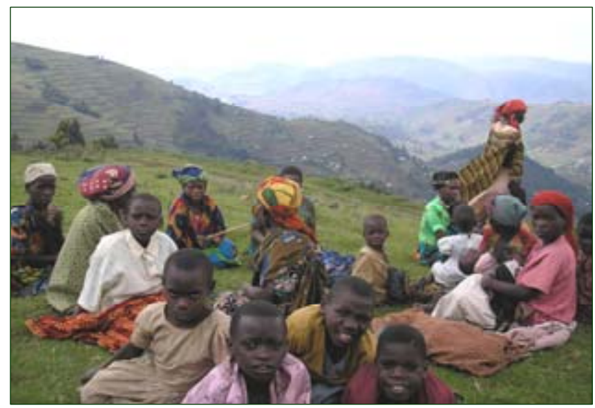
Community meeting, Murubindi, Uganda.

The Bwindi, Mgahinga and Echuya forests in southwestern Uganda were gazetted as forest reserves by the British in the 1930s. This effectively protected them from being destroyed by the agriculturalists who had moved into the area formerly inhabited only by the Batwa, while allowing the Batwa to continue to make use of them. However, since Bwindi and Mgahinga became national parks in 1991, Batwa exclusion has been